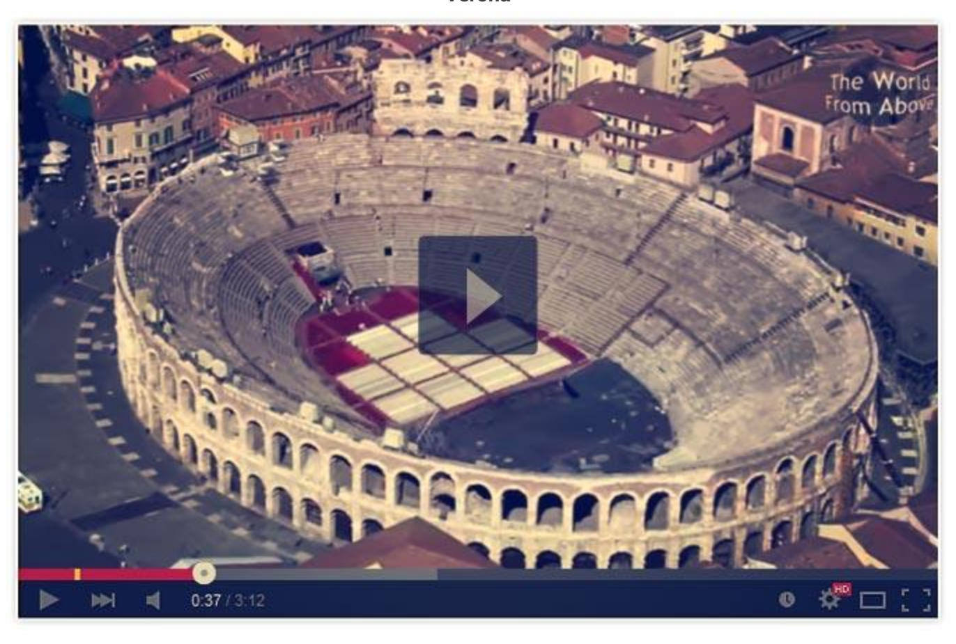
Day 9, Tuesday September 15 Verona

It is about time to learn and see more of this city. We booked the Hop On Hop Off bus tour to do this. I would recommend staying on the bus for the first trip around to find out what will really interest you. On the second round you can get then off and do your own sightseeing. You are free to spend as much or as little time you want. Here are some of the attractions: Roman Arena; Lamberti Tower; Juliet's house, Piazza delle Erbe; all the famous churches – St. Anastasia, St. Fermo, St. Giorgio and Baslilica St. Zeno. Castelo San Pietro, Porta della Bra, Giusti Gardens and Castelvecchio would be also important.