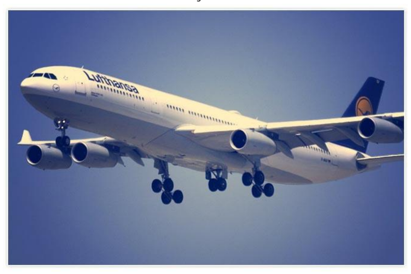
Day 1, Monday, September 07 Chicago-Munich

We are leaving Chicago late afternoon on your non-stop flight to Munich. Cocktails and dinner will be served en route. If you are coming from a different city, we can help you with your flight arrangements.