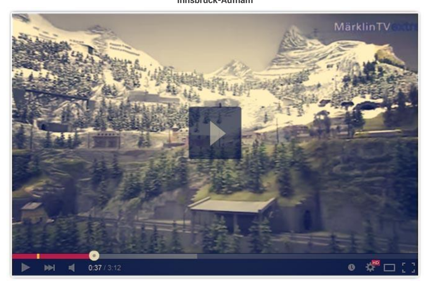
Day 4, Thursday September 10 Innsbruck-Aufham

Today, we are visting Hans-Peter Porsche's TRAUMWERK. Since his early youth Mr. Porsche was collecting toys from different eras. With this "museum" he is able to fulfill a long-cherished dream. The almost 6000 square feet layout depicts parts of German, Austria and Switzerland. There are over 180 trains moving along 10.000 feet of track, which will overcome a difference in altitude of almost 13 feet. It is an all Marklin trains layout with a highly detailed landscaping.