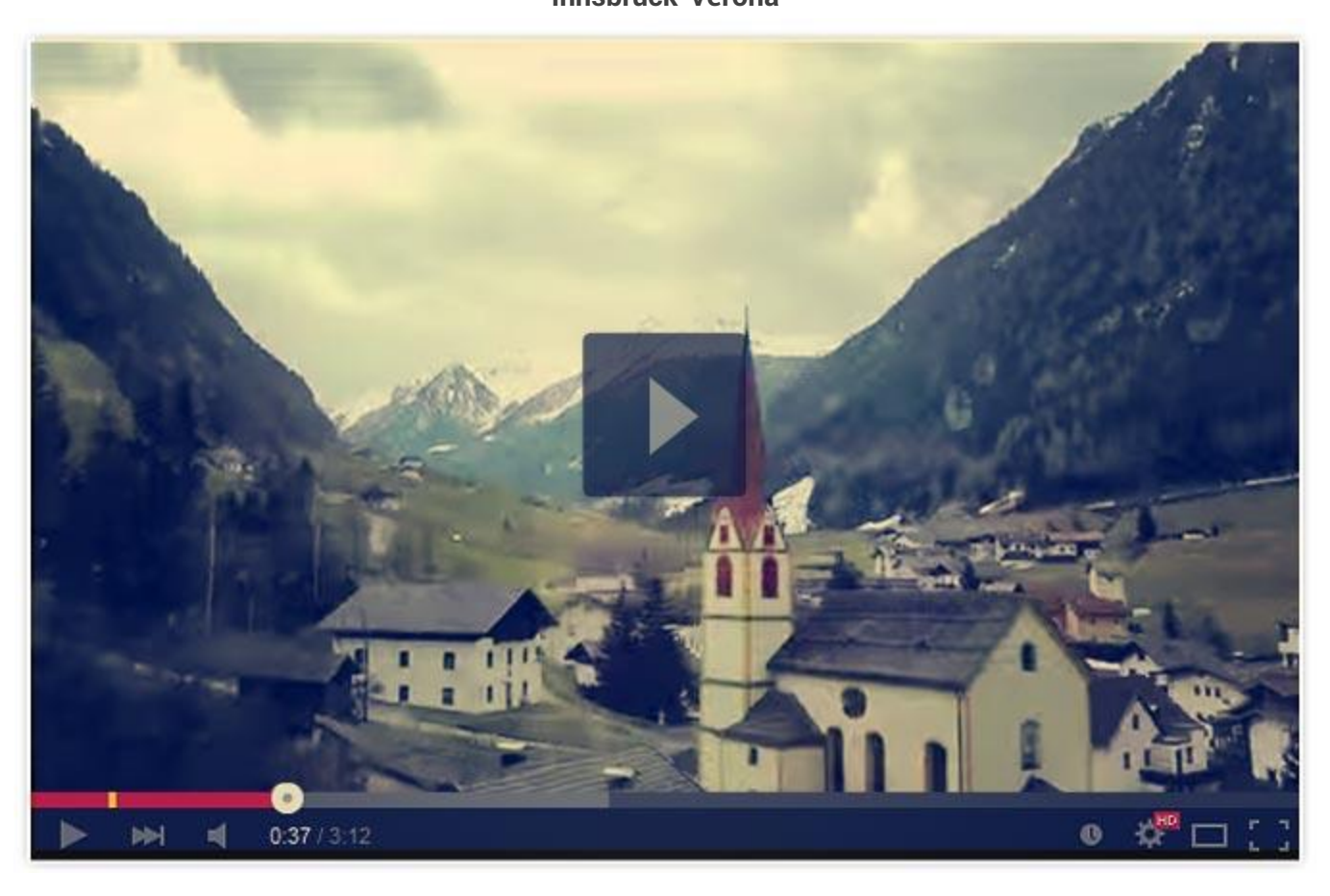
Day 6, Saturday September 12 Innsbruck-Verona

Our train will bring us in 3 ½ hours from Innsbruck to Verona (Italy). We will cross the famous Brenner railway pass which was the first through line to cross the Alps. At Brenner station we will most likely change locomotives. Even they have multi-system locomotives nowadays it is not sure that the locomotive engineers are familiar with the signaling and rules of the Italian state railway. After checking into our new hotel, we give you the rest of the day off to relax, shop or do as you wish.